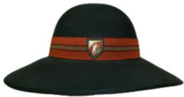
Formal Hat Round Style