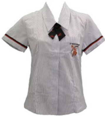
Formal Stripe Blouse