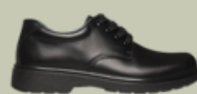
Clarks Daytona Junior/Senior