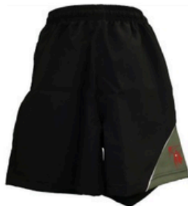
Sport Shorts Long Leg