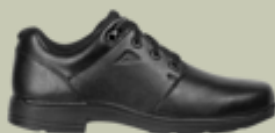
Ascent Prospect Junior

College formal shoes must be black, leather, polishable, school shoes. These shoes are not to be flat soled, but should have a clearly defined sole and heel resembling a traditional school shoe. No runners, desert boots, suede, ballet type shoes, high tongues, platforms, high rollers, skate shoes, deck shoes, Converse, Vans or any other fashion canvas shoes are permitted.