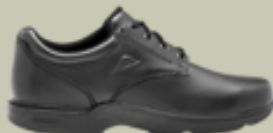
Ascent Apex Junior/Senior