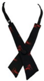
Short Crossover Tie (Seniors only)