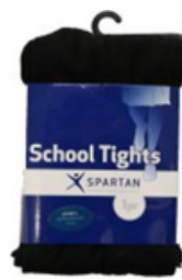
Black Opaque Tights