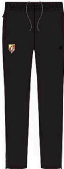
Tracksuit Pants *Only allowed to be worn with sports uniform