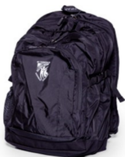
College School Bag