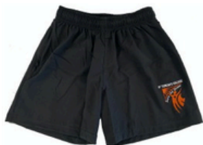
Sports Shorts Short Leg