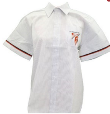
Formal Stripe Shirt