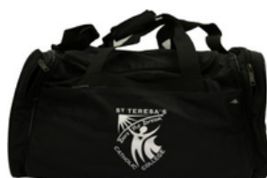
College Sport Bag