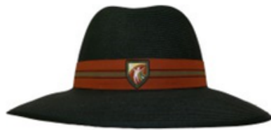
Formal Hat Digger Style