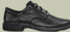
Ascent Scholar Junior/Senior